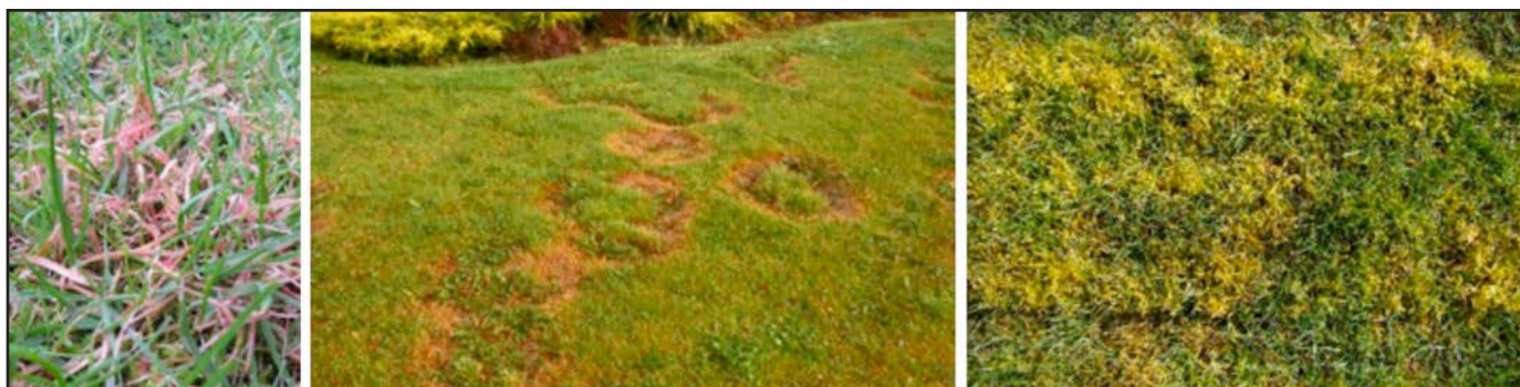
Image 1: Red thread of perennial ryegrass (left) is easily controlled with increased fertility, necrotic ring spot of Kentucky bluegrass (middle) can be mitigated with core cultivation, and finally moss can be reduced by reducing shade and irrigation rates (right).