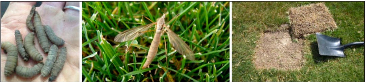
Image 3: A leather jacket, the larval stage of a European crane fly (left), feed on the turf roots for 11.5 months, before it emerges as an adult for a 2 week period in the fall (middle), during which it reproduces, lays eggs, and then dies. Scouting at a three inch depth using a flat end shovel should be done in the winter months before the larvae reach the third instar (right).

Turfgrass insects feed on either the roots or the foliage. For root feeding insects, such as white grubs and crane fly larvae, soil sampling should be done with a shovel (Image 3 and Table 2). For foliage feeding insects, such as billbugs, chinch bugs, armyworm and cutworm, do irritant sampling with dish detergent - lemon scented is typically the most effective (Image 5). Scouting periods vary significantly from insect to insect (Table 2). For instance, the optimum time to scout for fall armyworm is July and August, while crane fly larvae is December and January, and white grubs (Japanese beetle, European chafer and May/June beetle) can be found from September to October. Action thresholds can be set for insects according to their reproductive cycles. Once the insect population reaches the action threshold, control measures may be needed. Insect action thresholds range significantly from insect to insect - 1 fall armyworm per square foot to 80 billbugs per square foot (Table 2).