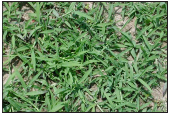
Image 6: Weeds like common dandelion (left) are easily controlled with curative applications of post-emergence herbicides containing 2,4-D, while annuals like crabgrass (right) are best controlled with preventative applications of pre-emergence herbicides.