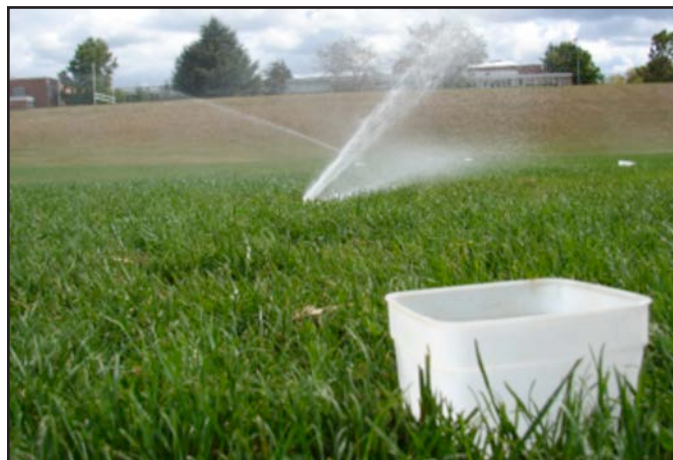
Image 4: Use a rain gauge (left) or collection cup (right) to determine your irrigation depth. Adjust run time to apply 0.25" per application 4 times per week to provide a cumulative weekly depth of 1".

The second point is increasing the number of weekly irrigation events, but not the irrigation depth. Weekly irrigation depths typically range from 0.75 to 1.5 inches depending on the environmental conditions. Applying irrigation at a 0.25 inch depth 4 times per week will put your irrigation program at 1 inch cumulative depth. If more water is required, increase the number of events per week, not the irrigation depth. In reference to proper IPM, this is essential because periods of drought stress between irrigation events will increase turf susceptibility to disease like necrotic ring spot, summer patch, and anthracnose. Weeds that are an indication of too little irrigation include false dandelion and summer annuals like crabgrass. Weeds that are an indication of excess water include moss, sedges, annual bluegrass, and rough bluegrass.