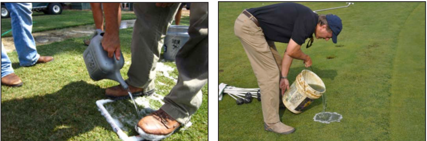
Image 5: For irritant sampling of foliage feeding insects apply 3 fl oz of lemon scented dish detergent to every 5 gallons of water using a watering can (left), or bucket (right).