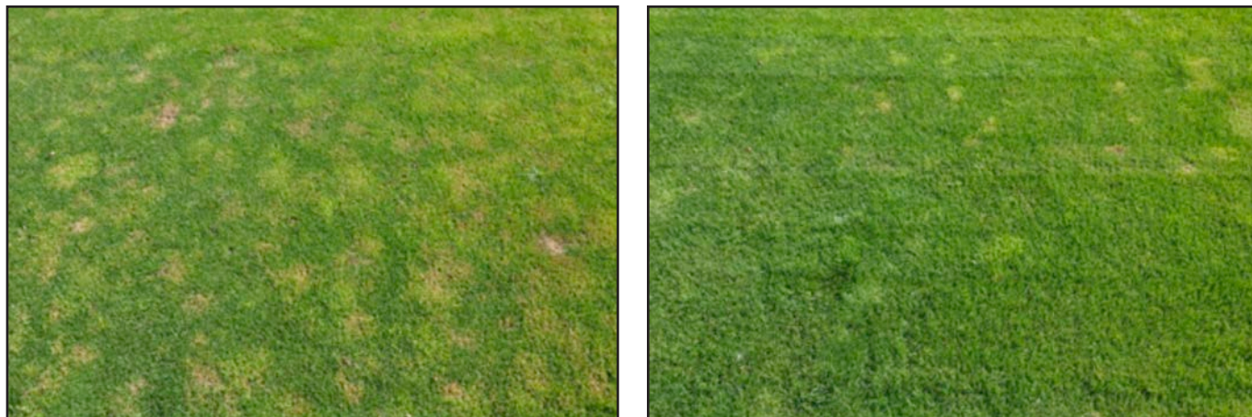
Image 2: Annual bluegrass encroachment within a stand of perennial ryegrass maintained at a 0.625" height of cut (left), in comparison to a perennial ryegrass stand maintained at a 1.25" height of cut (right), Corvallis, OR, 2013.

reduce crabgrass cover by up to 52%, dandelion by up to 45% and white clover by up to 58% (Calhoun et al., 2005; Kowalewski et al., 2010). Other work has shown that annual bluegrass encroachment can be substantially mitigated by increasing the mowing height from 0.625" to 1.25" (Image 2).