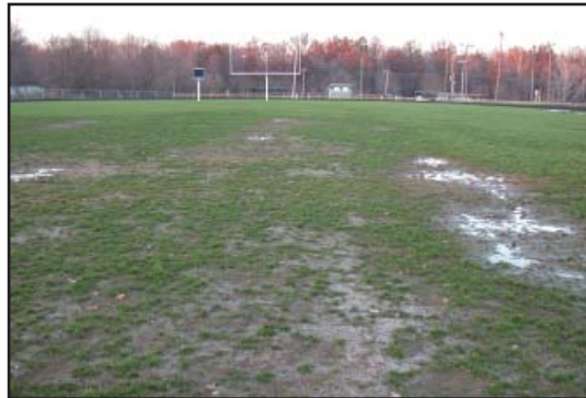
Figure 1. Heavily trafficked athletic field

Turf quality on municipal athletic fields is typically poor due to excessive traffic from soccer and football. These heavily trafficked fields often have compacted soils that reduce turf density. Aside from poor playability and poor turf quality, heavily trafficked sports fields provide less cushion and increase the risk of athlete injury.