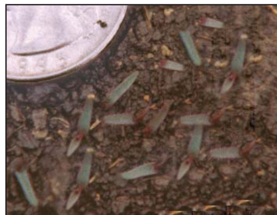
Figure 3. Bermudagrass seedlings

five to eight weeks after seeding or sprigging.