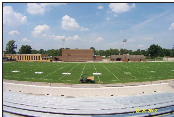
Figure 5. Overseeded bermudagrass football field at the end of October in Evansville, Indiana.

Bermudagrass has several advantages over perennial ryegrass and Kentucky bluegrass for use in athletic fields, including aggressive summer growth and better disease tolerance. Although bermudagrass might not be appropriate for every field, it will provide cover on overused summer and fall-use fields. Using bermudagrass in southern Indiana and southern Illinois can improve safety, playability and aesthetics of athletic fields.