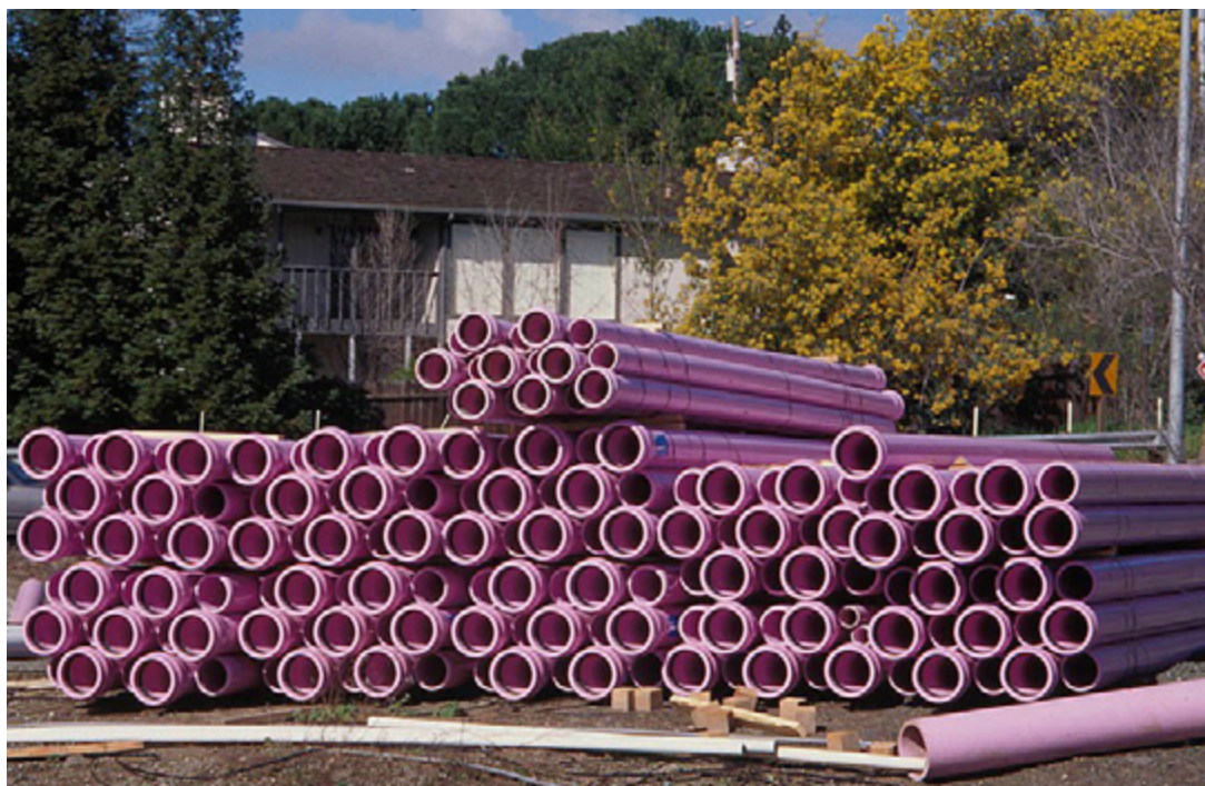
The color purple is now widely accepted as the official color for recycled water conveyance equipment. Almost all irrigation system components are now available in purple.

of adequate water within the rootzone. For such osmotic stress symptoms, the term physiological drought is often used. High salinity can also cause some ions (e.g., sodium) to be absorbed by the plant in high enough quantities to cause tissue burn or to compete with other essential elements, creating nutritional imbalances. In most cases, injury