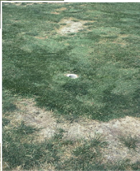
(Below) In early stages of salt buildup under saline recycled water irrigation, the stress caused by salinity may leave thinned, weak grass vulnerable to other stresses like heat, drought, or disease infection.