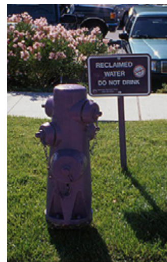
Presently, most of the turfgrass irrigated with recycled water grows on golf courses, sports fields, and parks. However, recycled water irrigation is increasing on other urban common spaces.

contact with human pathogens. The color purple is now broadly accepted as the official color for recycled water conveyance equipment. Almost all irrigation system components are now available in purple , including pipes, sprinkler heads, valves, and irrigation boxes.