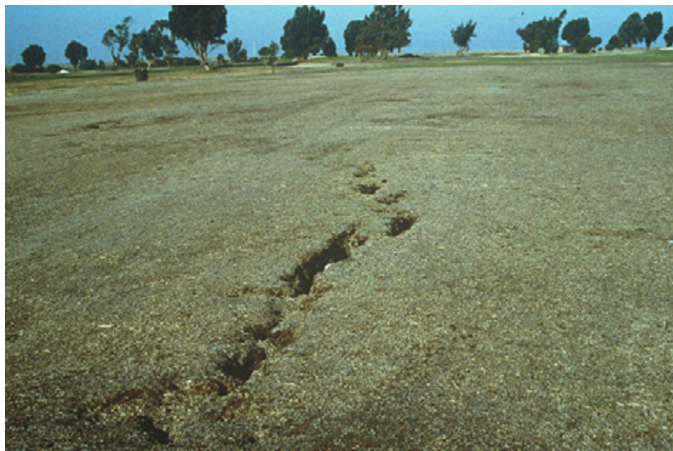
In most cases where significant drought conditions occur, turf and landscape irrigation is not a priority for municipalities, resulting in parched stands of grass.

“Recycled water” refers to water that has undergone one cycle of (human)