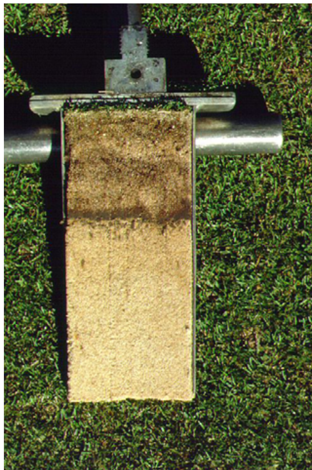
On golf greens especially, reducing or removing accumulated surface organic matter (thatch) is crucial under recycled water irrigation. Thatch and mat layers stop the flow of water through the soil and impede leaching of salts.

Blend irrigation waters. Frequently, poor-quality water can be used for irrigation if better-quality water is available for blending. The two waters can be pumped into a reservoir to mix them before irrigation. Although the resulting salinity will vary according to the type of salts present and climatic conditions, water quality should