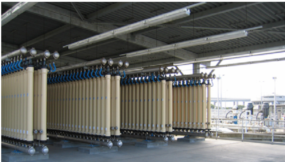
Advanced wastewater treatment involves processes and equipment similar to those used for potable water treatment. Advanced treatment is often referred to as “tertiary treatment.”

and ground water together are being rapidly depleted due to industrial and agricultural use and direct human consumption. Population growth accelerates and exacerbates the potable water scarcity. Also, human activities continue to pollute much of earth’s waters, contributing to potable water scarcity. It is estimated that by the year 2025, earth’s population will pass 8 billion, with the great majority of the population living in large metropolitan areas. Most of the world’s turfgrass (and other landscape plantings) is also in urban centers, where it competes with human consumption and food production for access to high-quality irrigation water.