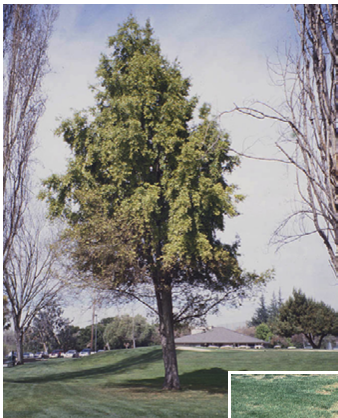
Under saline recycled water irrigation, injury to landscape plants other than turf often appears on lower foliage due to its direct contact with irrigation water.