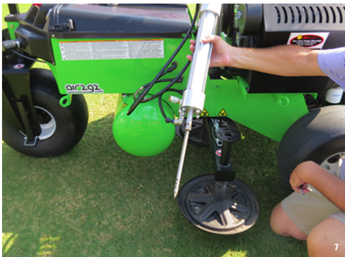
Figure 4. Air2G2 aerification equipment.

Hollow- and solid-tine coring, water-jet coring, slicing, spiking and high-pressure air injection (i.e., Air2G2 Aerifier) are methods of cultivation that are routinely used on fields to reduce soil compaction and improve air exchange. The Air2G2 is a new aeration method using pressurized air to relieve soil compaction with minimal to no surface disruption. Research at the University of Tennessee has found that the Air2G2 reduced soil bulk density from 1.63 to 1.39 g/cm 3 , as well as surface hardness by 21 percent (Sorachan and Dickson, 2014). The biggest advantage of using high pressure air or water injection is the reduction in downtime needed for turf recovery.