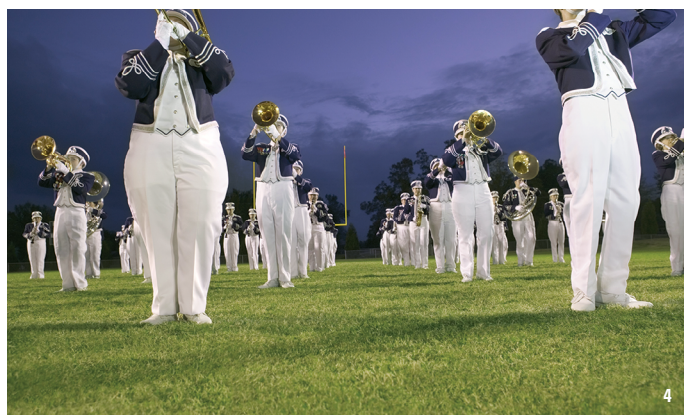
Figure 1. Marching band on the field at half-time.

An announcer coined the phrase 32 years ago, at one of the most improbable, last-second victories in college football history. The University of California Berkeley Bears completed five lateral passes during a kickoff return with four seconds left in the game. As the time on the clock was about to expire, the Stanford University marching band flooded onto the field early to celebrate the upset. Unfortunately for Stanford, the game was not over and the early celebration turned to tears when Cal scored a game winning touchdown. As was the case in 1982, having the band play on a natural grass field can be a bad idea with the exception of half-time performances.