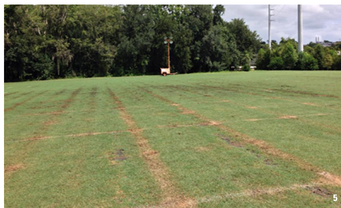
Figure 2. Band practice field at the University of Florida with extreme wear marks on yard lines.

Band directors need to realize their influence on field safety, playability and longevity. It is important to find a separate practice area on either grass or a parking lot, specifically for the band to use, with painted yard line markers. The area should be situated so the practice can be viewed from above, as if sitting in bleachers. Limit band practice on the game field to once per week and only when the soil is dry enough to resist compaction. Just like the football team, the band should never practice on the game field after a substantial rainfall event. The band member’s repetitive movements can cause significant soil compaction, wear and tear of grass resulting in a decrease of turf quality.