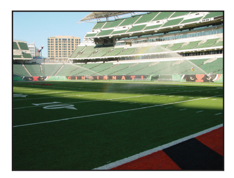
Irrigating synthetic turf.

All synthetic turf manufacturers have recommended maintenance practices. These include sweeping, dragging, loosening and redistribution of infill and cleaning. Cleaning may involve watering and the use of special solvents and cleansers. Depending upon use and weather conditions, infill material levels may be depleted. Check and maintain proper infill levels to provide a consistent surface. Consider topdressing annually to help restore the field's resiliency. The sports turf