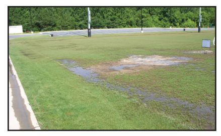
Poor field drainage on a soccer field improperly constructed.