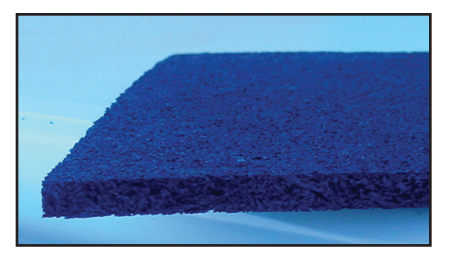
Example of a synthetic field pad showing its thickness.