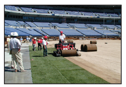
Example of laying sod on a football field.