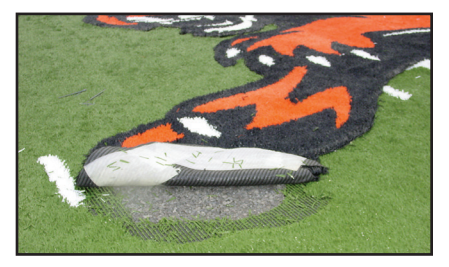
Installation of a special logo on a synthetic field.