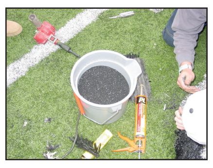
Rubber mix used for resiliency on synthetic fields.

The typical cost range to maintain a synthetic field will vary. However, an average field can require approximately $5,000 - $8,000 per year in material costs and approximately 300-500 hours of labor cost per year to maintain.* (Material costs include infill, paint, paint remover, disinfectants, gum remover, etc. It does not include equipment expenditures.) It is much more expensive to maintain synthetic fields that are highly visible or when used for multiple sports. The cost can even be higher if field markings must be painted and cleaned often, or if frequent repairs are necessary.