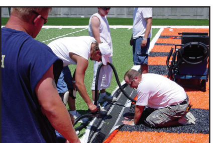
Seam construction on a synthetic field. Photo: Darian Daily

Construction profile for a synthetic field. Photo: Darian Daily