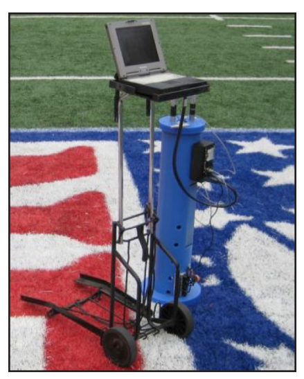
F355 Device - Photo courtesy of Tom Serensits

The Clegg Impact Tester (F355 missile D) and the ASTM F355 missile A device can be used to measure Gmax on synthetic turf fields. The NFL also requires Gmax measurements on synthetic fields prior to every game. If the Clegg Impact Tester is used, all areas within the field of play must be below 100 Gmax. If the ASTM F355 missile A device is used, the maximum limit listed in ASTM 1936 is 200 Gmax. According to ASTM, values of 200 Gmax and above are considered values at which life-threatening head injuries may be expected to occur. The Synthetic Turf Council (STC) recommends Gmax not exceed 164 for the life of the field when using the F355 missile A device. If areas are above the limit, additional