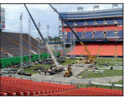
Set up for a concert showing field protective coverings.

Care must be taken to protect each type of field surface. Typically, a sports turf