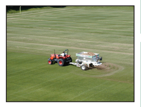
Example of topdressing a football field.