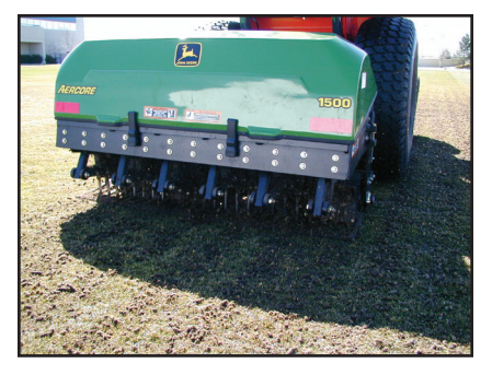
Example of a sports field being aerified.

watering and fertilization. They may also require additional maintenance with top-dressing. Debris is usually removed by mowing, sweeping, and flushing the field with water.