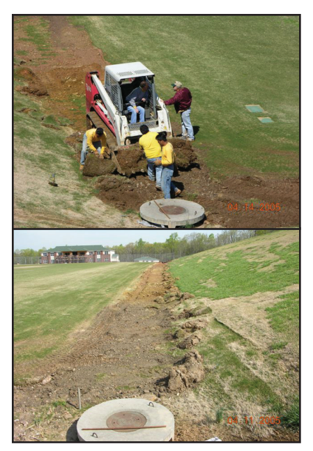
Example of bad conduit installation along edge of a natural turfgrass field and reconstruction to fix it.

Following is a typical cost range and what is included in that range to build a natural turfgrass field constructed of native soil(s).